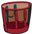
Tinted Plastic Bag