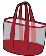
Oversized Tote Bag