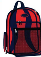
Clear Backpacks (Larger than 12 x 6 x 12)