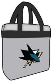
Clear Plastic Bag