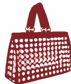
Printed Pattern Plastic Bag